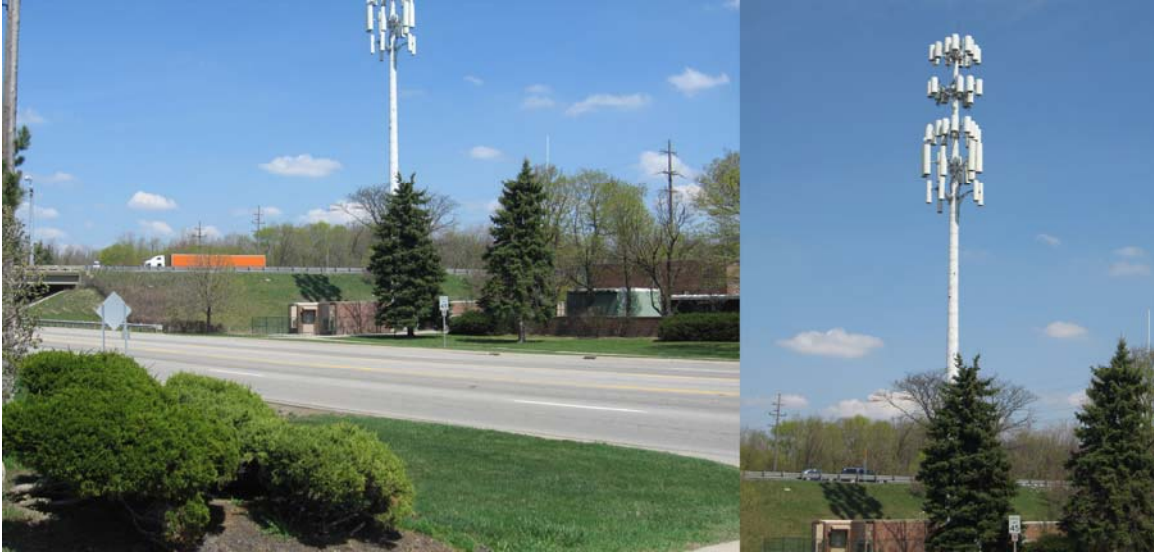
Figure 3, Generic St. at Unnamed Rd. Interference Location

Based on prior investigations, Client's representative believes that all of the narrowband carriers from this site are Nextel carriers and the two wideband carriers in the 870MHz range are Verizon. Additionally, Client's representative indicated that during a previous site visit, it was determined that Nextel seemed to be the primary factor in the interference. 1