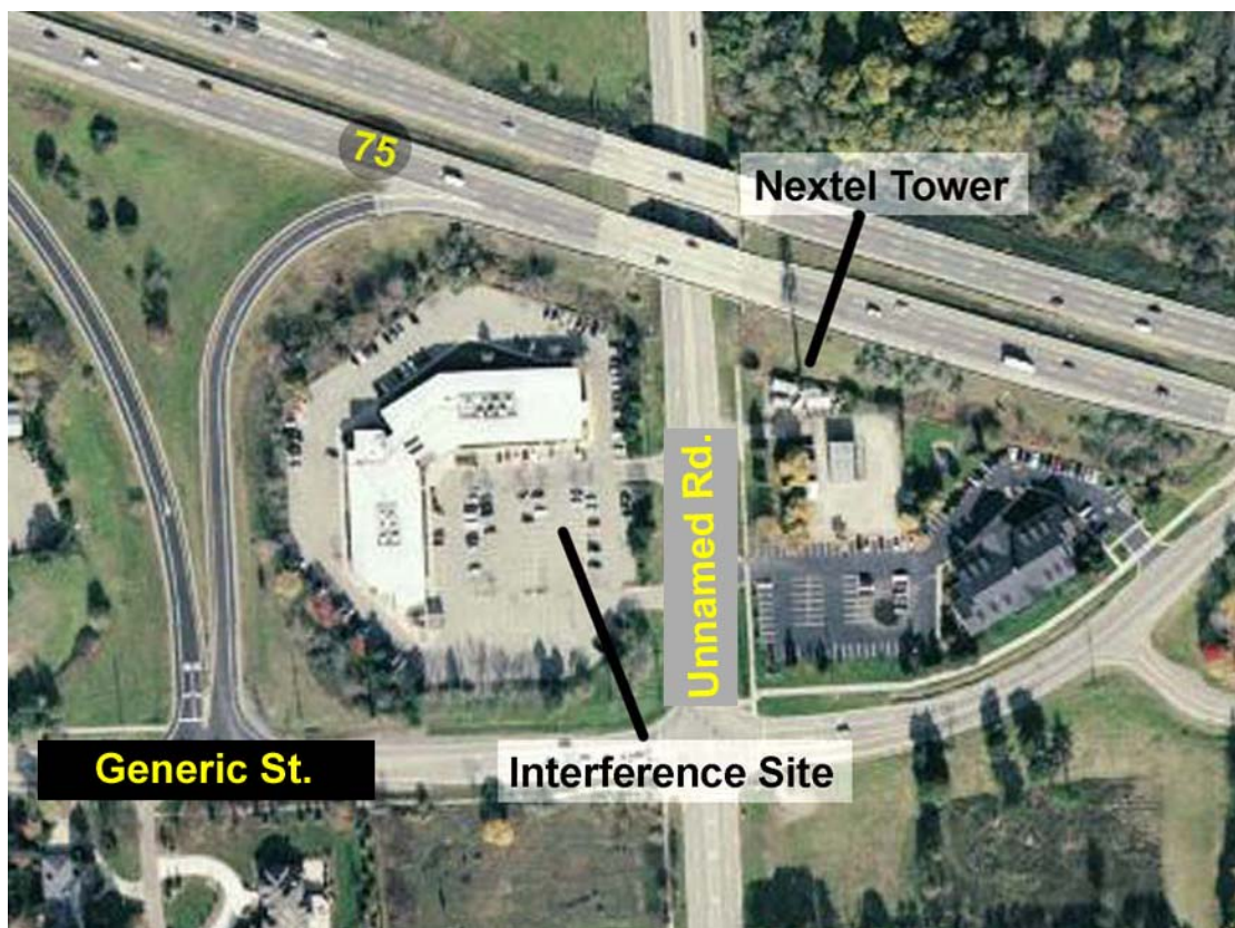
Figure 2, Generic St. at Unnamed Rd. Interference Location, Areal View

Next, Client’s representative and 360°RF’s engineer travelled to the interference location at the intersection of Generic St. and Unnamed Rd. to observe actual interference with several handheld radios. This site, pictured in Figure 2 , is across the street from a large Nextel and Verizon site. Figure 1 shows an aerial view of the site with the cellular tower and reception issue areas marked.